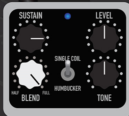
Nashville Lead Compression