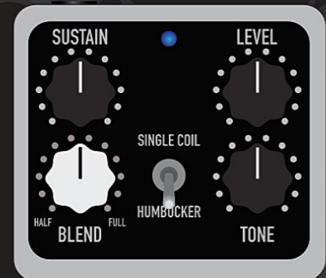
Perfect Humbucker Compression