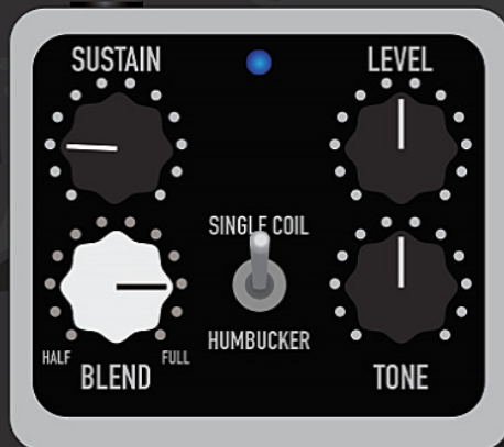
Always On Compression